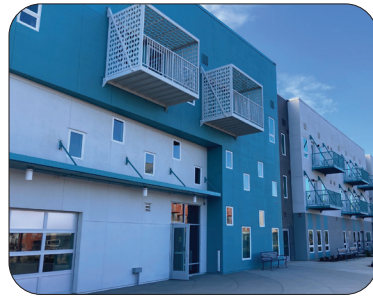
Mutual Housing on the Boulevard

LSS moved 15 seniors from homelessness into new one-bedroom apartments in this beautiful new building. Crossroads is our third program serving Solano County (after CalAIM and StopPlus). This project is also a new partnership with PEP Housing.