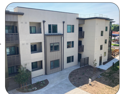
Pony Express Senior Housing

In October, we opened Crossroads in Vacaville. Crossroads is part of Pony Express Senior Apartments, which provides 59 affordable one-bedroom apartments for low-income seniors and veterans.