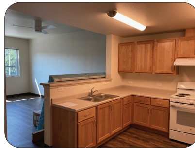
Apartment at Crossroads

In early December, we began welcoming formerly homeless individuals and families into Mutual Housing on the Boulevard in Sacramento, a combination affordable and supportive housing residence with 127 1, 2 and 3-bedroom apartments across several buildings. This new residence houses families and individuals with 17 units set aside for those exiting homelessness. This is our third residential partnership with Mutual Housing.