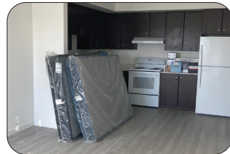
Apartment at Mutual Housing on the Boulevard

We are in the final stages of hiring for our new college initiative at Shasta College in Redding. In January, LSS will start providing housing and supportive services to 30 students each semester on all three Shasta College campuses (Shasta, Tehama and Trinity).