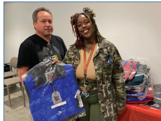
Urban Angels vests for children

Every year, Urban Angels SF donates backpacks filled with school supplies to our San Francisco students for Back to School and joins LSS and our San Francisco housing partners when we hold special events for our residents, including this year's Father's Day Celebration at LaFenix. Urban Angels SF has a mission to alleviate the tensions of families experiencing homelessness and income instability.