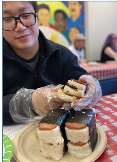
Our SPAM sushi event in SF

In partnership with the Bernal Heights Neighborhood Center and Housing Corporation , LSS provides community activities and supportive services for the residents of Bernal Gateway, an affordable housing residence for 55 families in San Francisco. This partnership launched in 2002, and together, LSS and the Center coordinate several community-building activities including a recent SPAM sushi-making event.