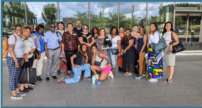
LSA Inaugural Lived Voices Fellowships Participants

In early 2024, Lutheran Services in America launched its inaugural cohort of emerging leaders from across the nation, amplifying the voices and perspectives of communities often excluded from housing, health services, education, and economic opportunities. These fellows experienced significant personal and professional growth, coming together as a powerful network of change agents.